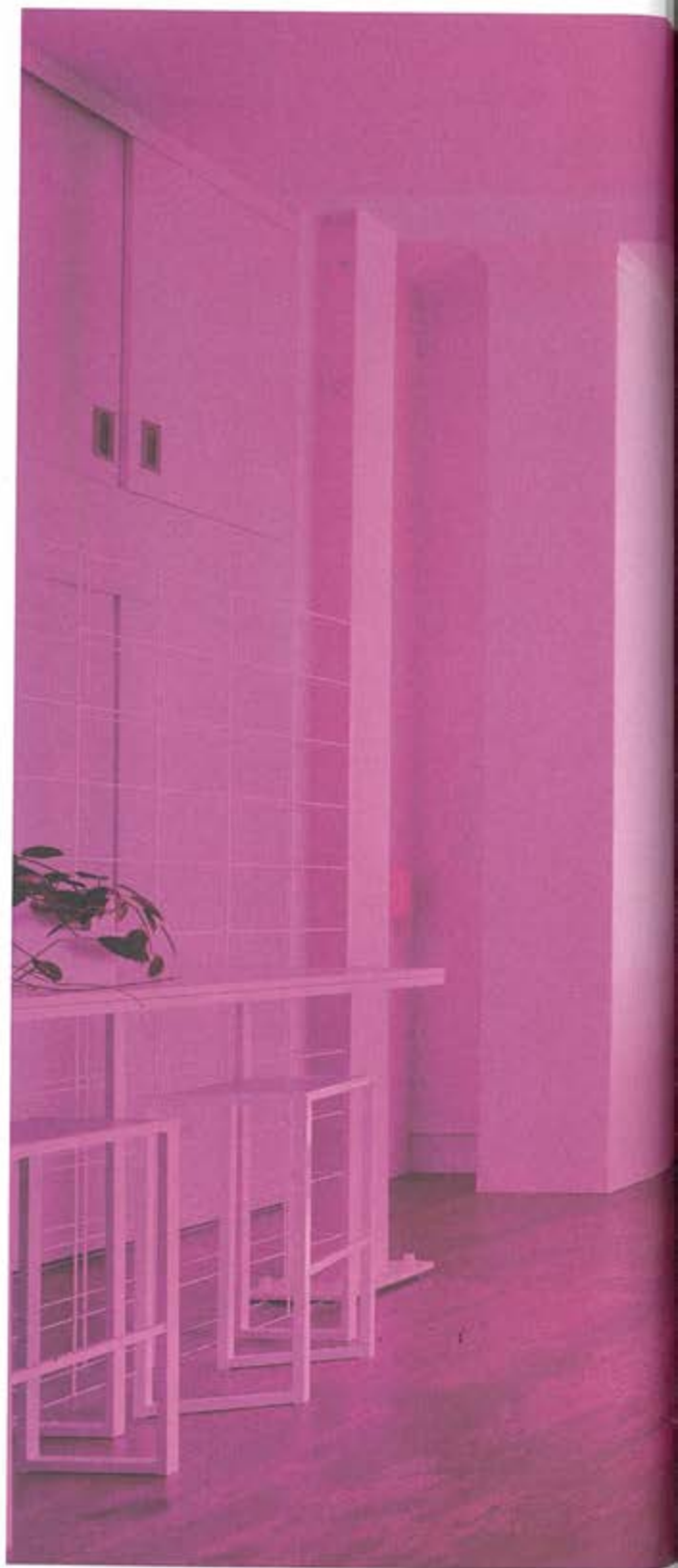
An LED hydroponic system emits an unexpected magenta light, the perfect hue for promoting plant growth.