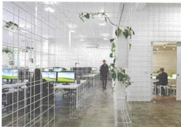
A wire matrix creates corridors and sculpts seating areas to transform into a grid-like landscape.

To give each employee the chance to add a personal touch to the otherwise uniform surroundings, each workstation can be customised with a range of specially-designed screens, hooks and containers for plants, stationary or personal belongings. Indeed, greenery forms an important element of the design: biophilia – bringing elements of the outside in – has been deliberately implemented to improve workplace satisfaction. As well as the plants inside individual working zones, larger planters containing creepers click into the grid, solidifying the space as they grow. In the main meeting room, an LED hydroponic system beams magenta light on plants – a colour chosen as it matches Squint/Opera's house style and, by sheer coincidence, it also turns out to be the ideal shade for promoting plant growth.